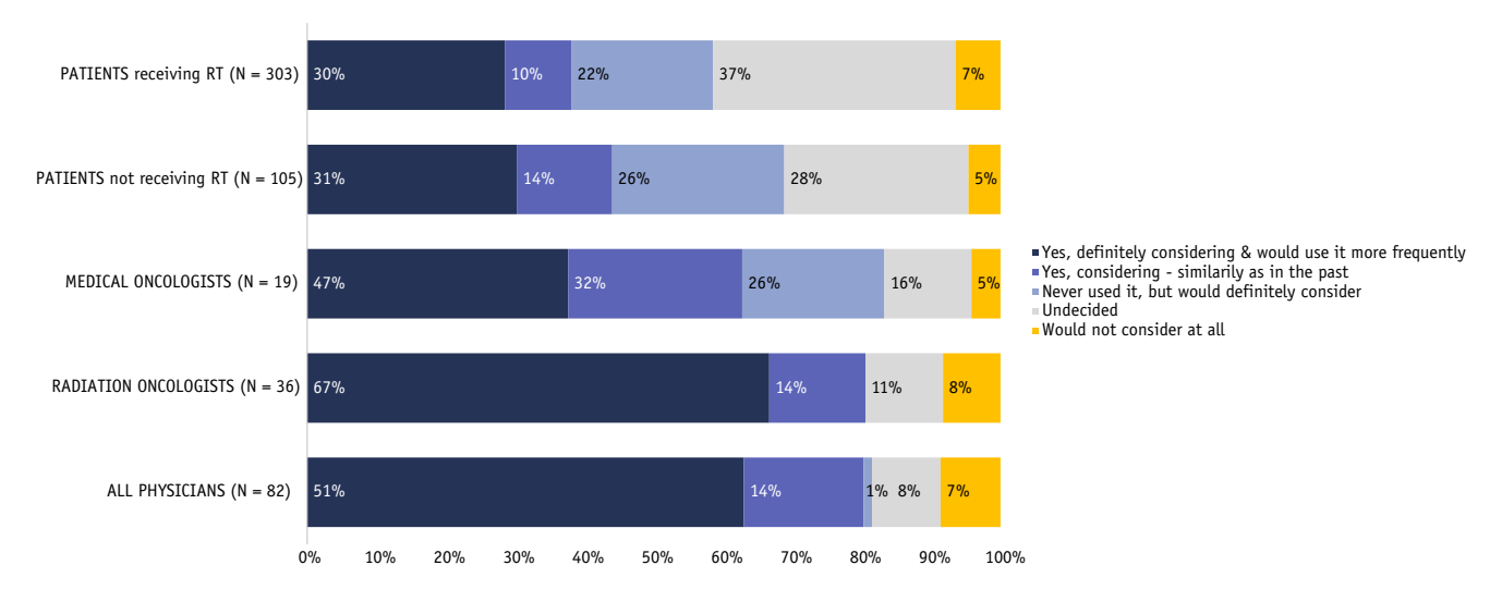
Fig. 1. Expected use of telemedicine in oncology post—COVID-19 pandemic. Abbreviation: RT = radiation therapy.

which would include video call as well. Nonetheless, 92.6% of patients who had a phone consultation with their oncologist described their experience as either good or exceptionally good. Regarding the post-COVID-19 era, 30.6% of patients expressed interest in more frequent usage of telemedicine, 23.3% would start using it, and 27.9% of participants were undecided. No differences in interest in future telemedicine use were observed between patients treated with RT or not treated with RT (62.7% vs 74.3%, respectively; P = .309) (Fig. 1) or between patients aged \geq 50 years versus \leq 49 years (61.5% vs 73.2%, respectively; P = .161). For patients who were treated with RT, 59.9% and 63.4% of the responding patients (N = 297) acknowledged that video consultations would be an important addition to medical care during an existent RT course or after the completion of RT treatment, respectively. The level of patient agreement with statements on benefits of telemedicine is presented in Figure 2.