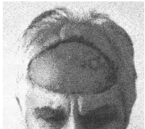
Figure 1. General appearance of the lesion (5x6cm).

On physical examination of the patient with recurrence referred to our clinic, a mass of the size 10 x 6 cm was found on the left