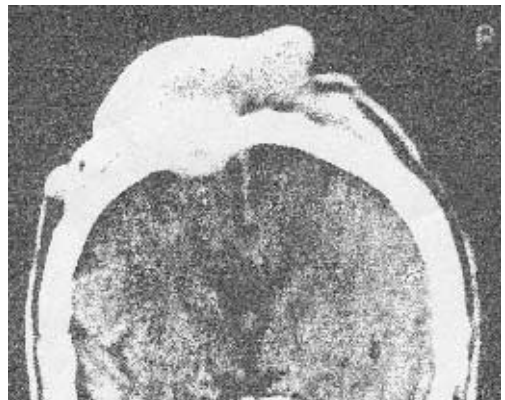
Figure 3. Radiological appearance of the lesion invading the cranium (CT).

nodules of cylindromas cover the entire scalp and are heaped up, they resemble a turban. Despite its histological benign behaviour, the disease process is distressing for the patients. 8 Cylindromas rarely progress to cylindrocarcinoma. 11-13 Most of these cases of cylindrocarcinomas have developed from