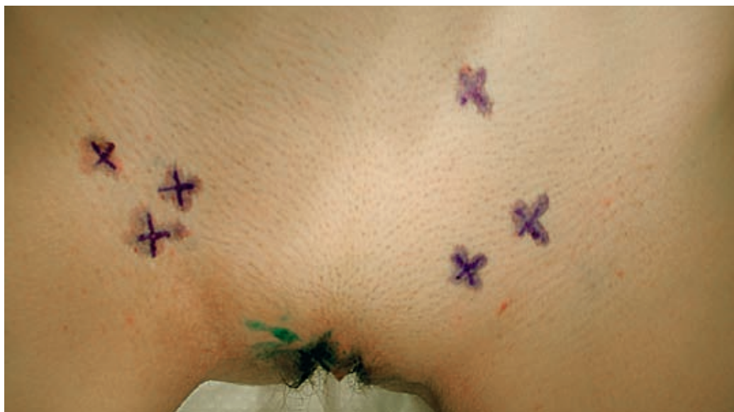
Figure 2. Active nodes were marked on the skin.

down to the femoral canal were removed. The patient underwent also CT examination which detected that deeply seated pelvic lymph nodes were also metastatic.